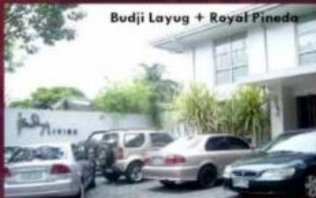
Budji Layug + Royal Pineda