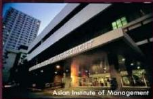
Asian Institute of Management