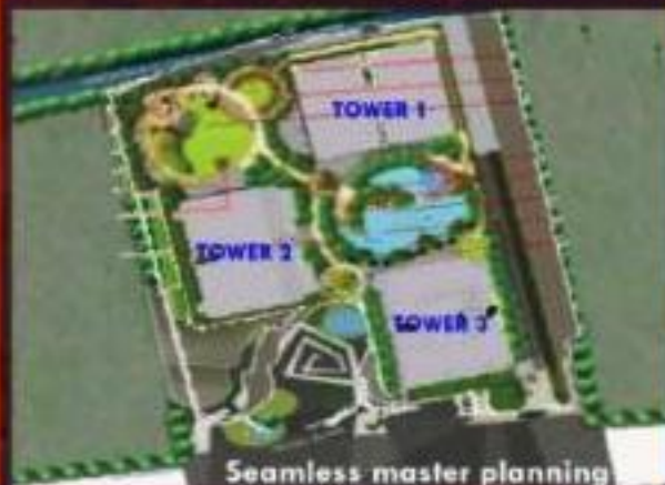
Seamless master planning