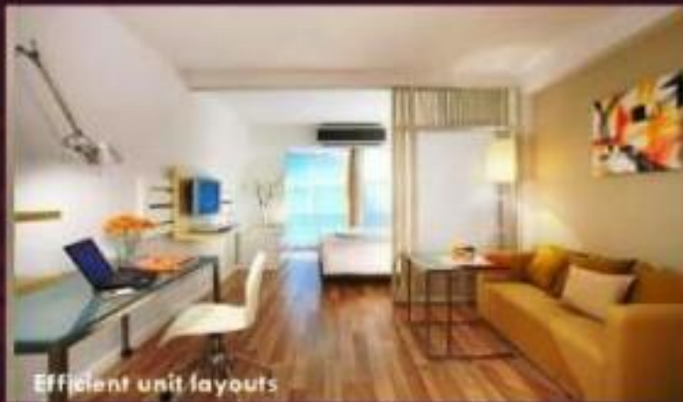
Efficient unit layouts