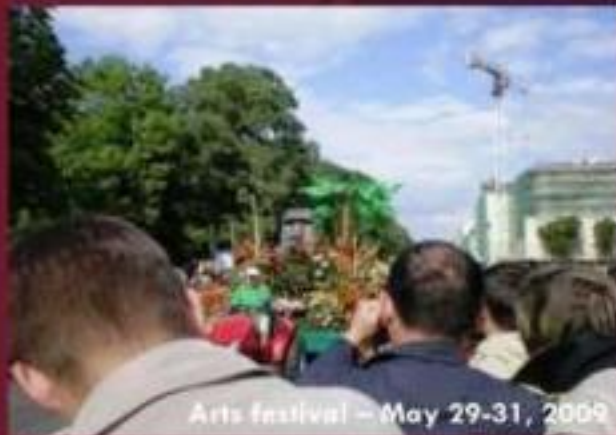
Arts festival – May 29-31, 2009