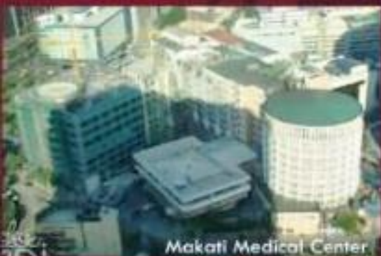
Makati Medical Center